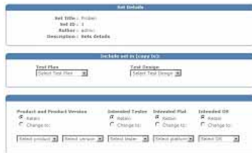
Including Sets under a Test Design

First lets select the regression test set that we've already created. Then we'll include this set in a Test Design document, creating two new test scripts with which to start our testing on the new version of software. In the example above we can see that the act of including this set allows us to select, which