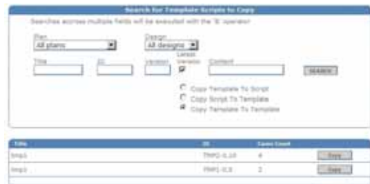
Copying Test Scripts

Using the Templates copy functionality, shown in the example on the right, we search for and then copy our existing test scripts. This action creates new templates. These templates can then be used as the basis for constructing a regression test set.