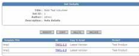
A Set containing two Templates

Next we pull these newly created Templates into a Set of regression test scripts/templates. Using the sets functionality in QaTraq we create a new Set. With a new Set created we search for, and add references to these new Templates we created in step 2 above.